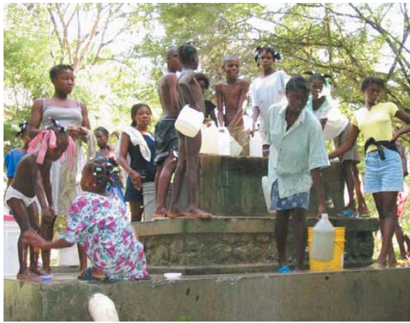
The water project done in 1985